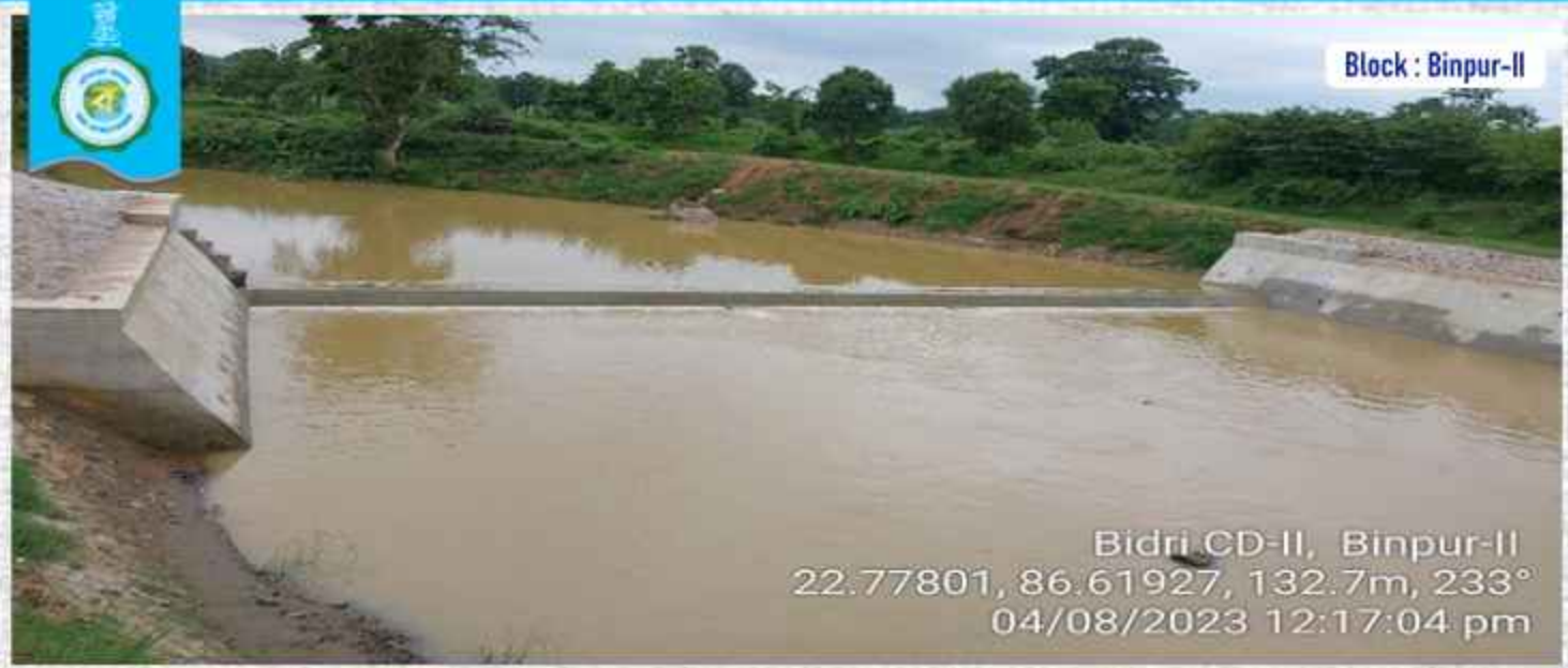
Block : Binpur-II

Bidri CD-II, Binpur-II 22.77801, 86.61927, 132.7m, 233° 04/08/2023 12:17:04 pm