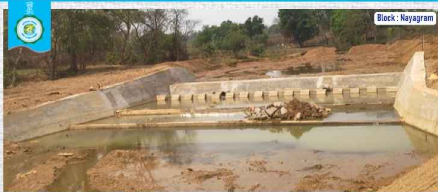
Block : Nayagram