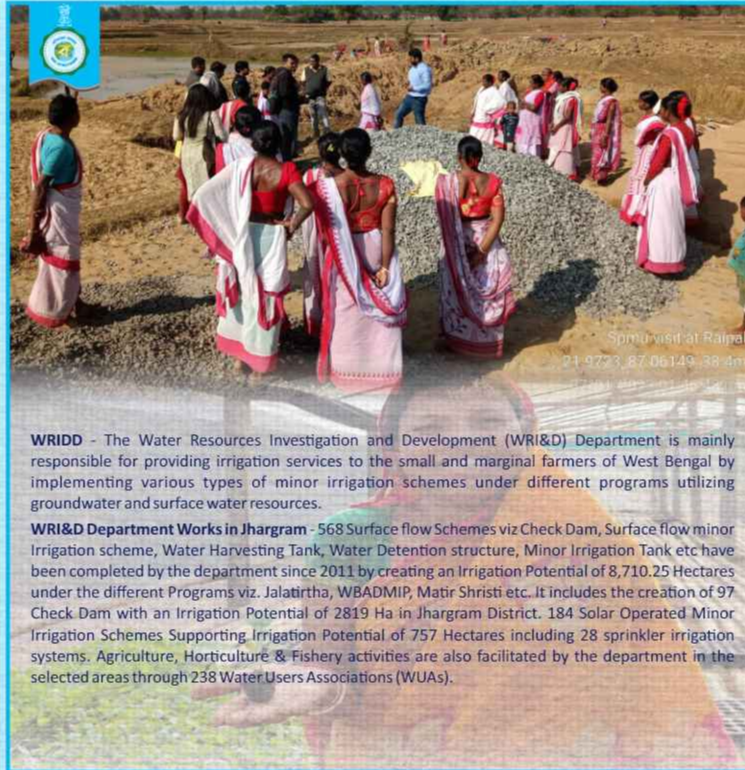
Spmu visit at Raipal