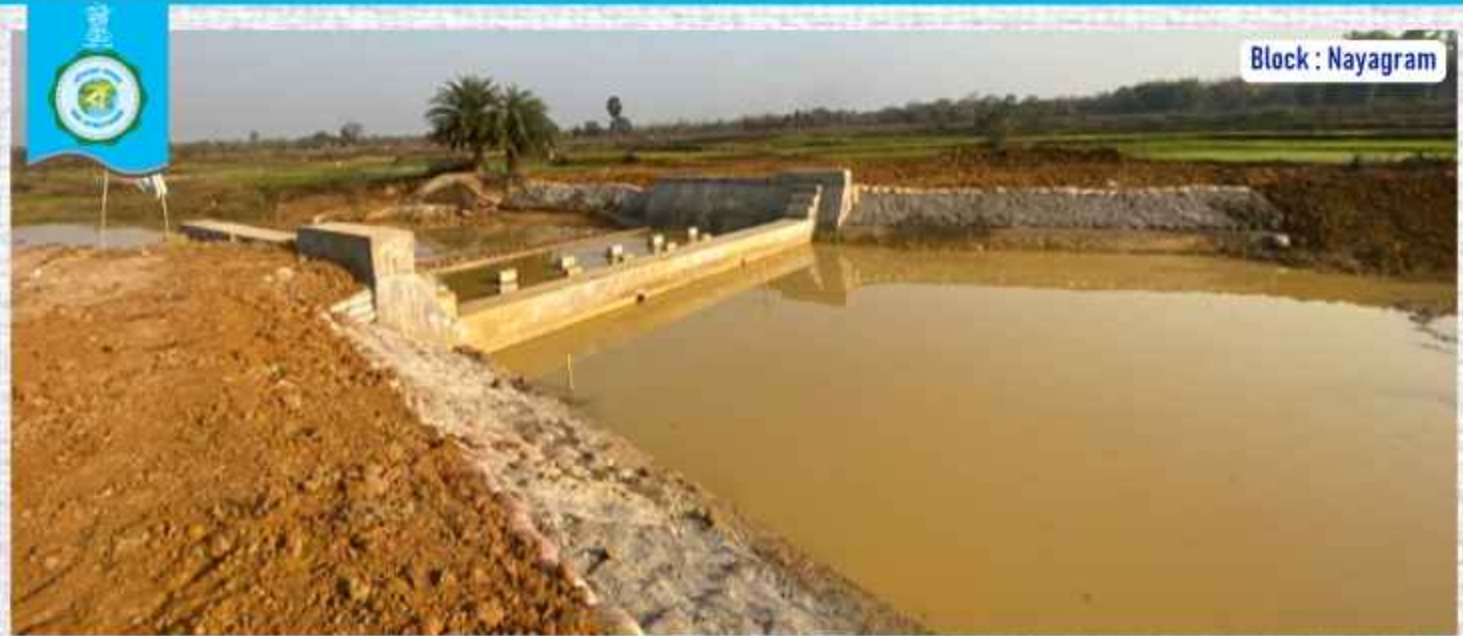
Block : Nayagram