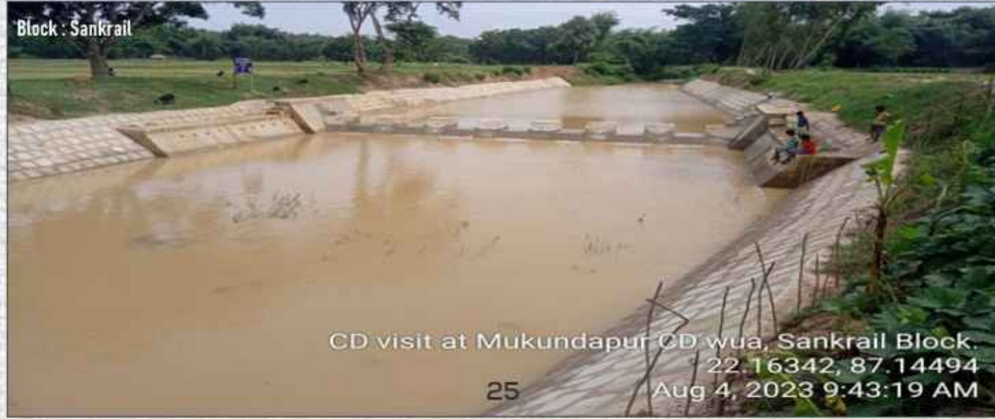
CD visit at Mukundapur CD wua, Sankrail Block. 22.16342, 87.14494 Aug 4, 2023 9:43:19 AM