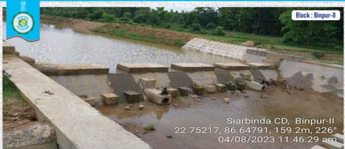
Block : Binpur-II

Siarbinda CD, Binpur-II 22.75217, 86.64791, 159.2m, 226° 04/08/2023 11:46:29 am