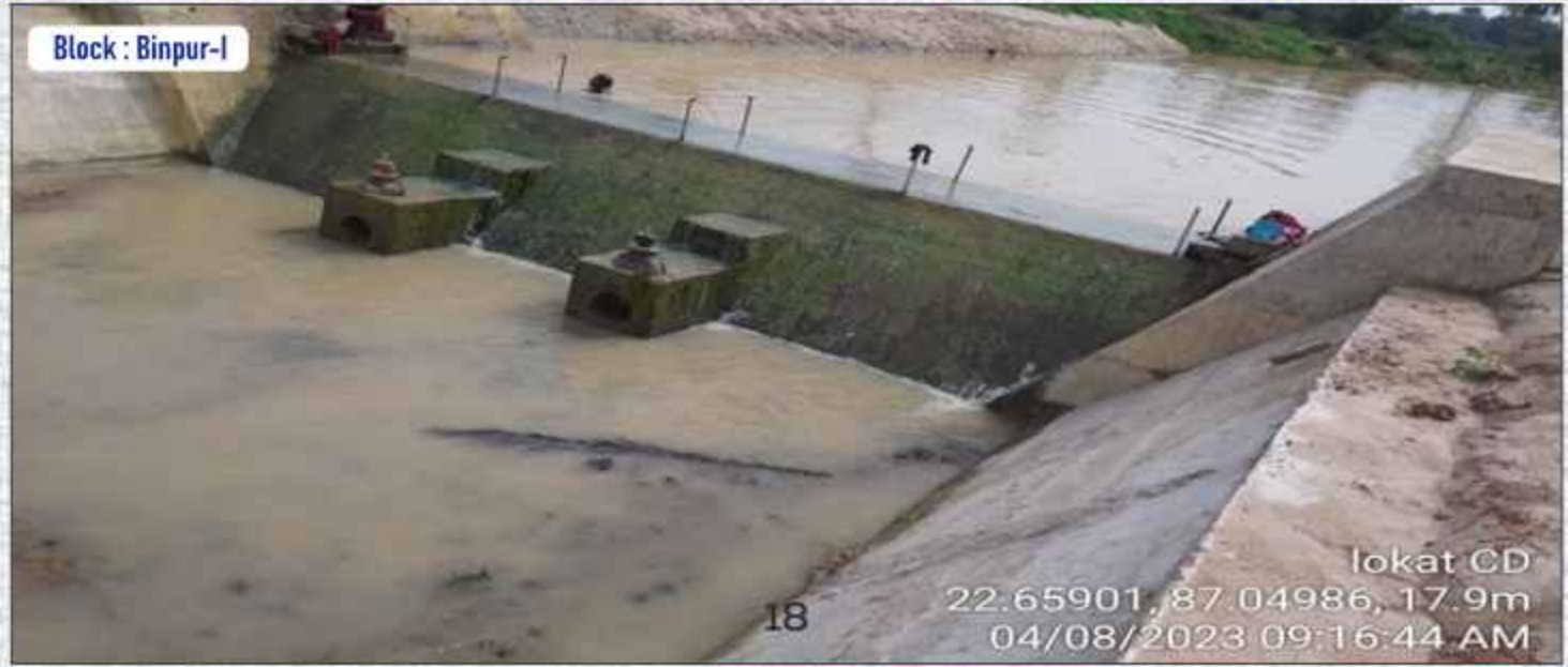
Block : Binpur-I

lokata CD 22.65901, 87.04986, 17.9m 04/08/2023 09:16:44 AM