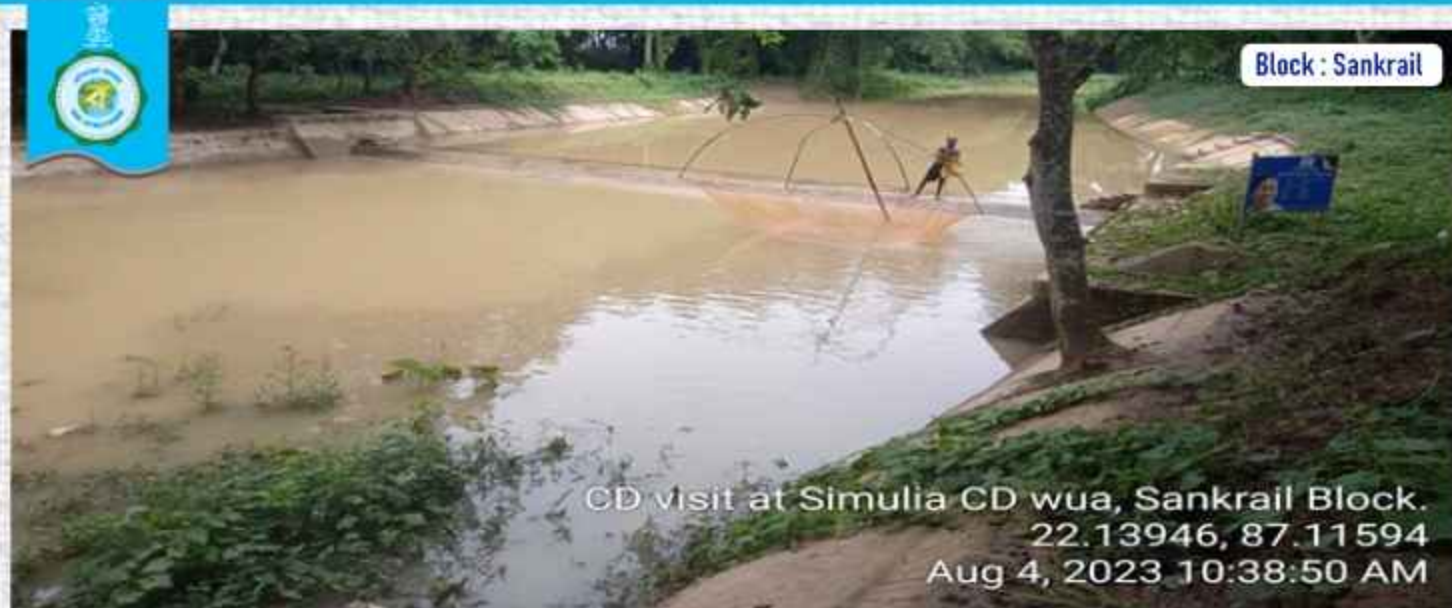
CD visit at Simulia CD wua, Sankrail Block. 22.13946, 87.11594 Aug 4, 2023 10:38:50 AM