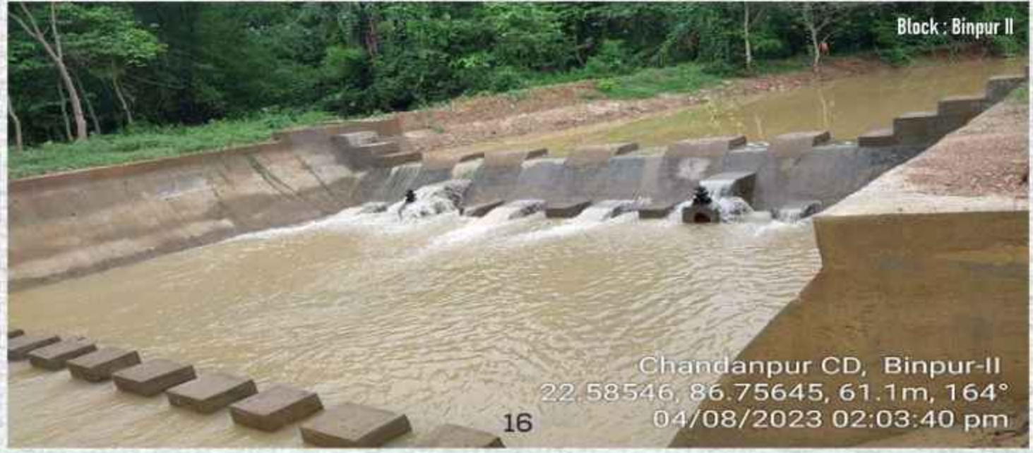
Block : Binpur II

Chandanpur CD, Binpur-II 22.58546, 86.75645, 61.1m, 164° 04/08/2023 02:03:40 pm