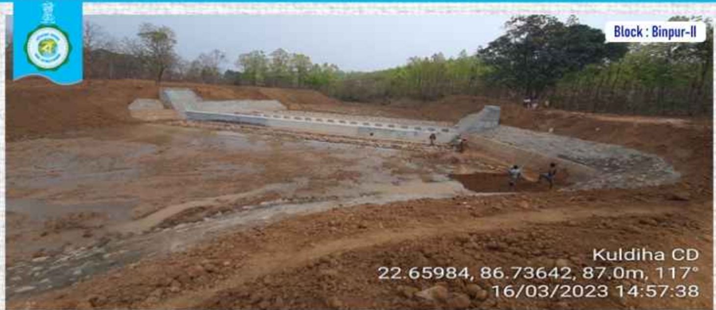
Block : Binpur-II

Kuldiha CD 22.65984, 86.73642, 87.0m, 117° 16/03/2023 14:57:38